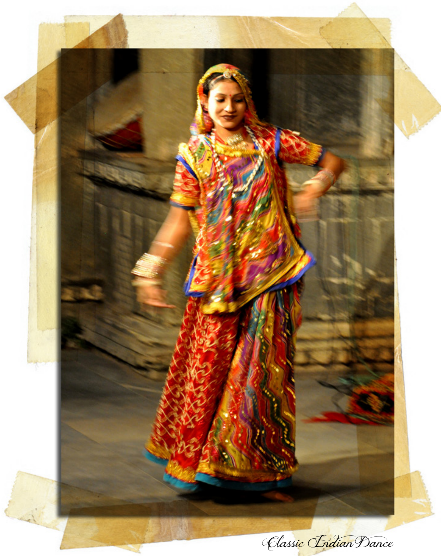
Classic Indian Dance