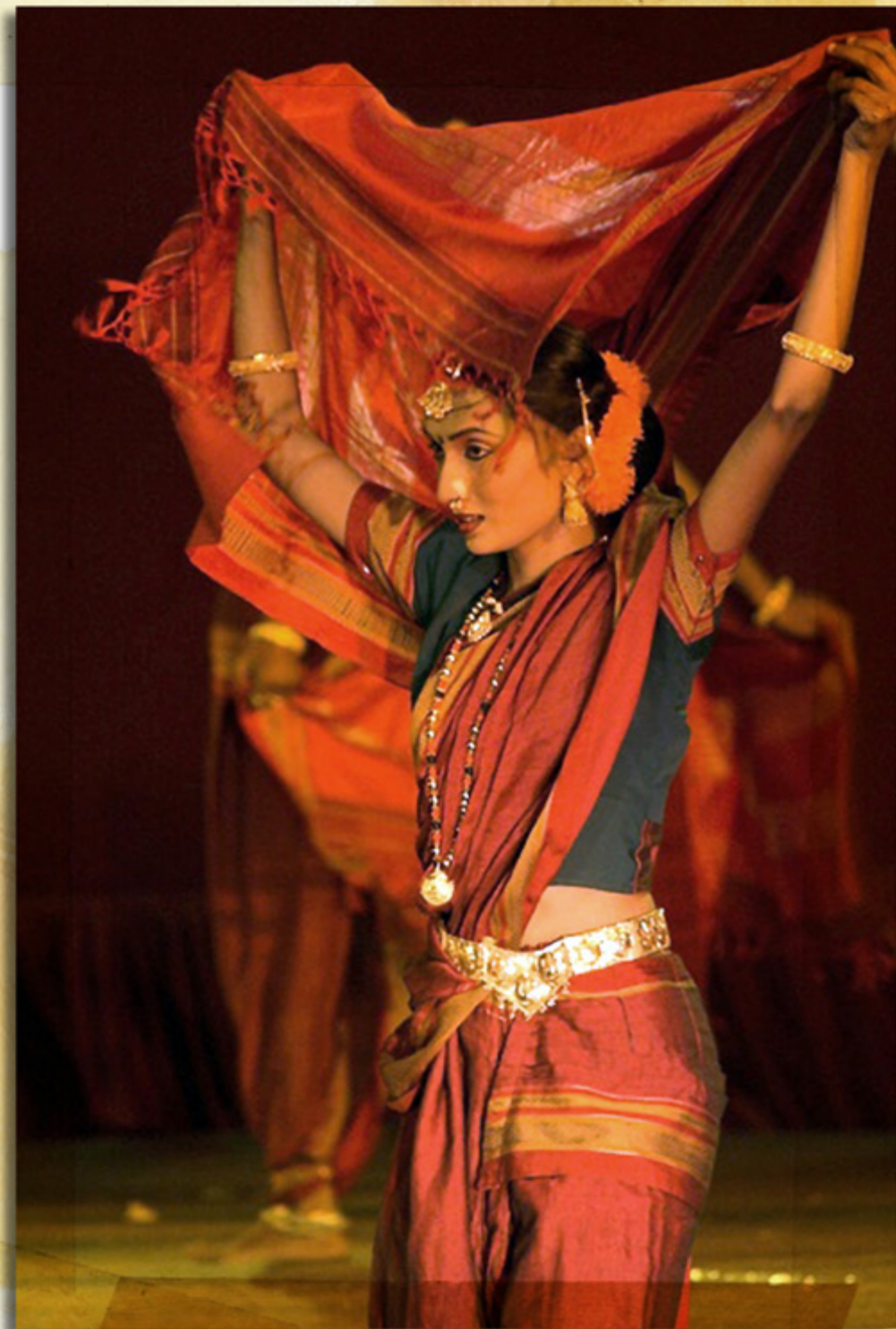
Lavani Dance from Maharashtra