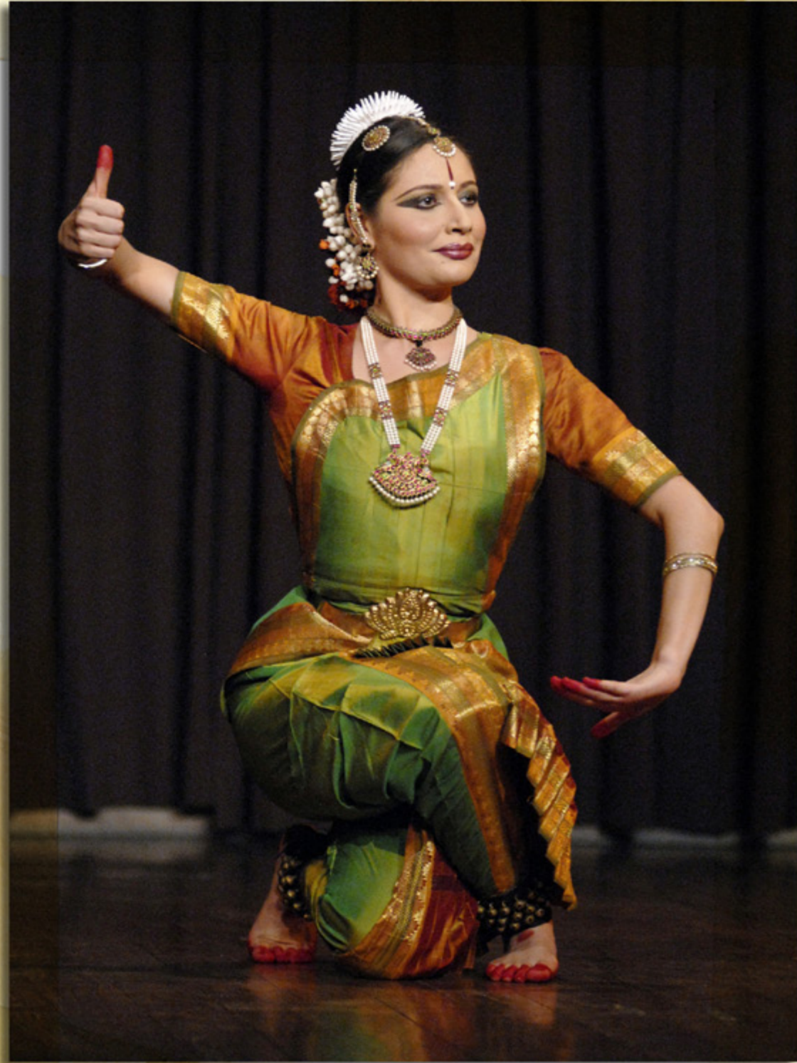
Traditional Indian Dance