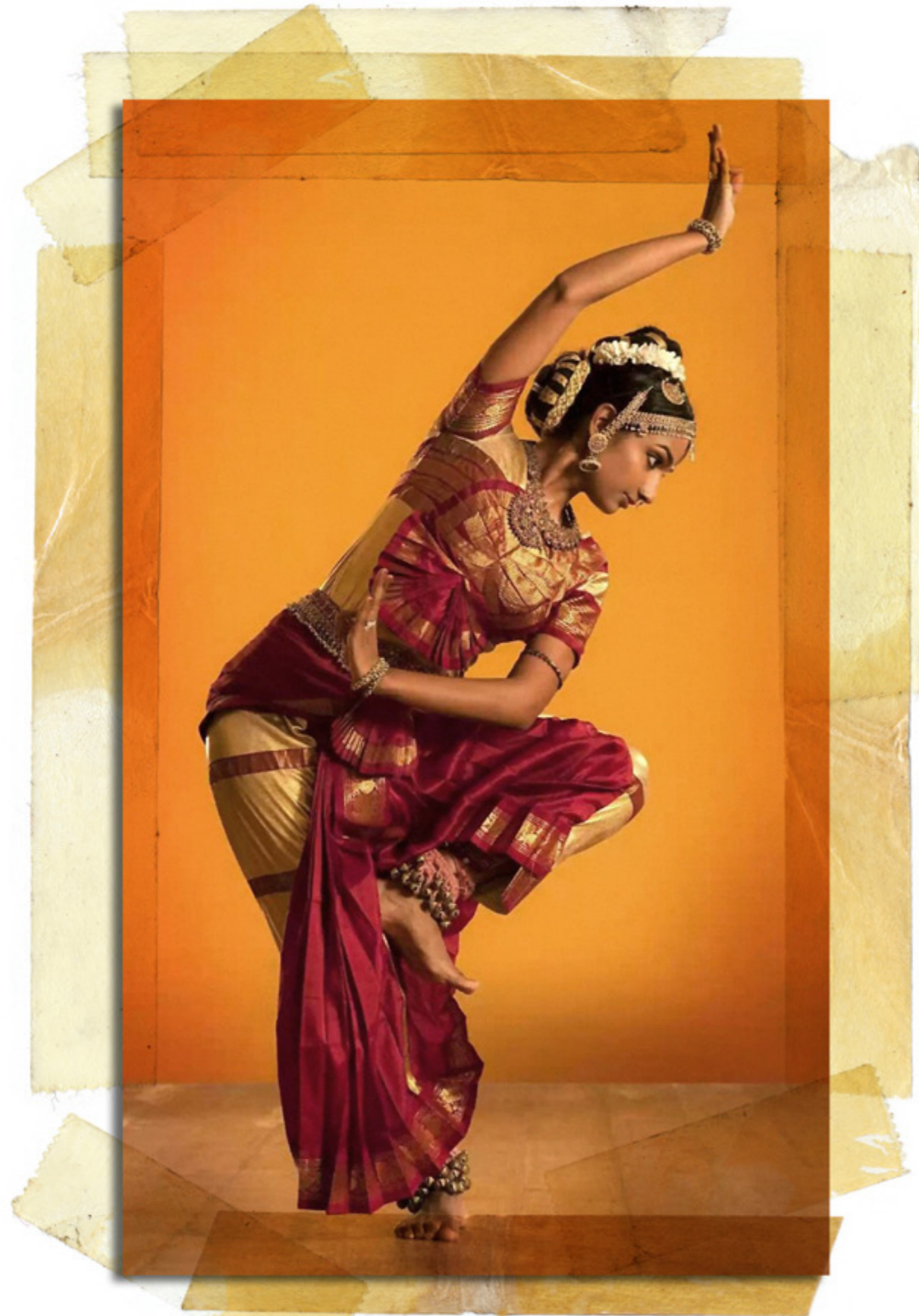
Dancer of Sri Devi Nrithyalaya Chennai South of India