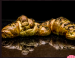
THYME CROISSANT 25 L.E.