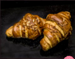
CHEESE CROISSANT 25 L.E.