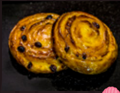
DANISH PASTRY 25 L.E.