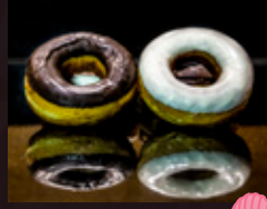
DOUGHNUT 25 L.E.