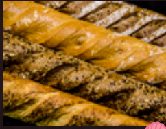
FRENCH BAGUETTE 35 L.E.

All prices are subject to 12% service charge & taxes.