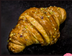
PLAIN CROISSANT 25 L.E.