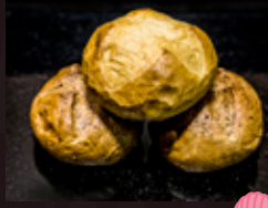
RAISIN ROLL 25 L.E.