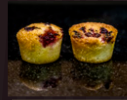
FINANCIER PATE DE FRUIT