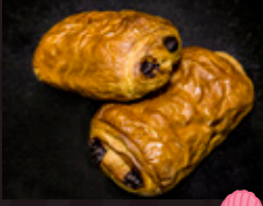
CHOCOLATE CROISSANT 25 L.E.