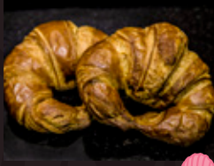
BUTTER CROISSANT 25 L.E.