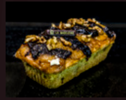
FRUIT MARZIPAN CAKE