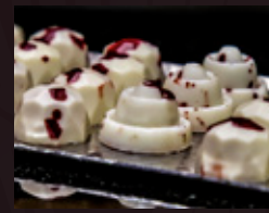
RASPBERRY WHITE CHOCOLATE