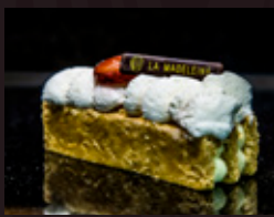
SQUARE MILLE FEUILLE