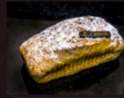
GLUTEN FREE CAKE