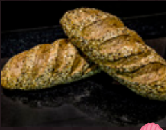
BREAD LOAF 30 L.E.