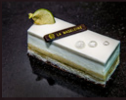
ROSEMARY APPLE CAKE