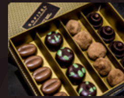
BOX OF CHOCOLATES