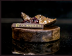
DARK CHOCOLATE TART