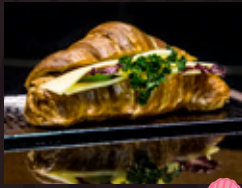
CROISSANT SANDWICH 45 L.E.